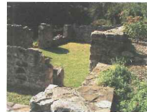
August 12, 2004 HISTORIC YELLOW SPRINGS

This year, the Village of Berwyn is taking part in the Tricentennial Celebration of Easttown Township founded in 1704. Come, visit and celebrate the many changes that have come to the tiny village that grew along the rocky ridge of the Great Valley. Learn how the impact of first the Lancaster Turnpike and then the coming of the railroad changed the development of the village as it changed into a suburban community along the Main Line.