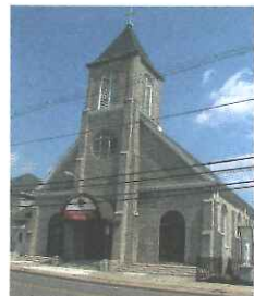
July 22, 2004 PHOENIXVILLE

Parkers Ford National Register Historic District is significant for commerce, transportation and military history between the years 1700-1899. Washington's Continental troops crossed the Schuylkill River at this point in September 1777. The Village is home to the Parker Ford Tavern built by Edward Parker and to be restored by East Vincent Township. Across the road, within view of the Old Canal, is the restored home of Henry Parker. Other features are the Railroad Stone Arch Bridge at Patty's Run, Canal Lock #57 and other historic properties.