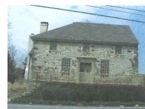
July 29, 2004 HISTORIC GOSHENVILLE