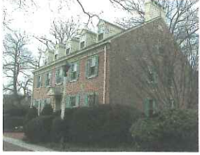
June 3, 2004 WEST CHESTER: FROM COUNTY SEAT TO COUNTRY RETREAT

Sponsor: West Chester Historical and Architectural Review Board Tour Reservations: 610-430-3222, ext. 10