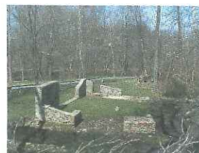
June 24, 2004 DOWLIN FORGE

A log schoolhouse stood beside the 1738 cartway, Indiantown Road, where wagons loaded with iron products from the furnaces passed through on their way to the Wilmington market. Later the 1859 schoolhouse with its second story community room became the setting for this historic Indiantown crossroads and the early Springton Manor story. As the Norwood hamlet grew into the Glenmoore village, ornately decorated houses were constructed for newly married couples, hence Bridal Row.