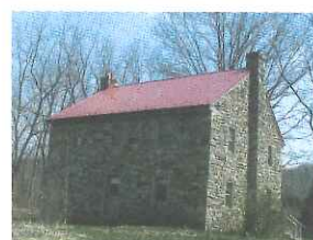
July 8, 2004 MERLIN HAMLET

This nearly untouched village, named for botanist Humphrey Marshall (born 1722), was an important stop on a road. There are two hotels in town and one outside, dating back to 1765. Among the outstanding features of this village were a Quaker Meeting dated 1730 (present building 1765), a cradle factory which made grain cradles and scythes, a blacksmith shop, a pump maker, a cigar factory, a tinsmith shop, a clothing store, a bakery, a plumbing business, a restaurant, in 1805 a post office and in 1829 a Methodist church.