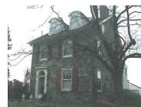
August 26, 2004 HISTORIC MARSHALLTON VILLAGE

Listed on the National Register of Historic Places, Goshenville was founded in 1704. A "Hall and Parlor" house filled with period pieces, the Milltown-Hickman Plank House (1808) is in the Historic American Building Survey. Retaining its functioning forge, the William Sharpless Blacksmith and Wheelwright Shop was built in two sections (1704-1740). Now a B&B, the Jesse Reece House (1800) was the first Post Office and General Store. The Wetlands Boardwalk will also be open.