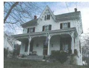
August 19, 2004 GLENMOORE