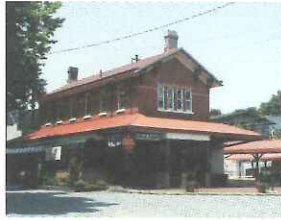
July 15, 2004 BERWYN

Come explore West Chester's northwest quadrant! Follow in the footsteps of County judges as they walked from home to office. Behold belvederes, balconies, and towers designed by nationally known architects. Discover why West Chester became a popular retirement and summer retreat. Pick from eight tours that will wind their way among sites as old as 1786 and as young as 1935.