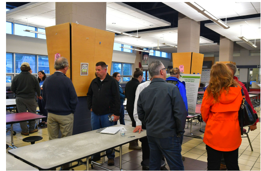
40+ members of the public attended and provided feedback at the May 28 th Open House

In addition to completing the goals and objectives for the Comp Plan update, the CCPC Team completed 1 st drafts of three existing conditions sections and plan chapters in 2025, including: Parks, Recreation, and Open Space; Multimodal Transportation; and Community Facilities and Services.